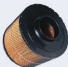
CARCAZAS FILTRANTES DE AIRE