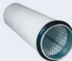
FILTROS DE PAÑO Separadores Aire Aceite