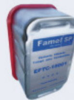
FILTROS DE COMBUSTIBLE