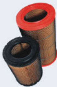
FILTROS DE AIRE SELLADO RADIAL