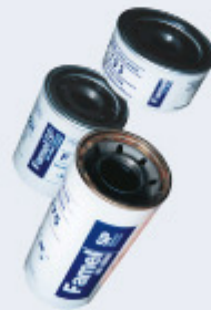
FILTROS DE ACEITE